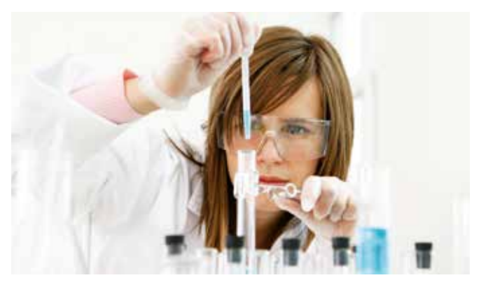
Then and now – Research and development make up a vital part of the company's core competence.